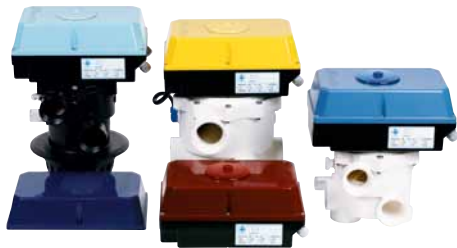
AQUASTAR Easy Colour